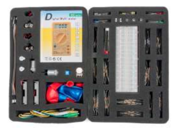
Materials to make the experiments

The activities of the internship are oriented to develop the sales in your country of origin: