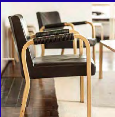
Artek Chair 46 1960s

The apartment is furnished in period furniture designed by the office of Alvar Aalto.