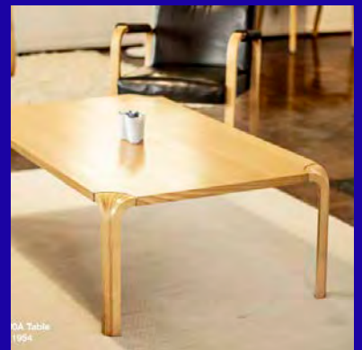
Artek Table MX800A 1954