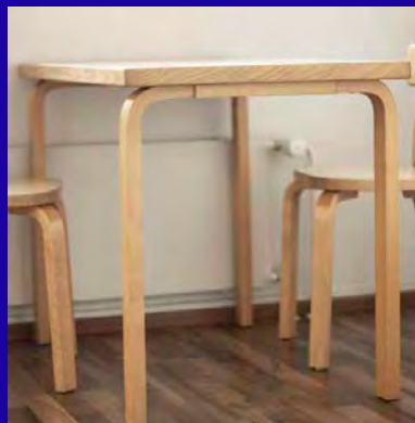
Artek Table 81b 1935