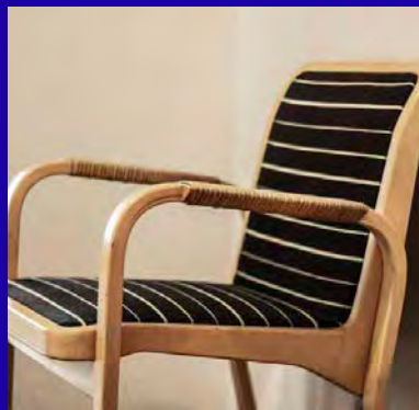
Armchair 45 1947