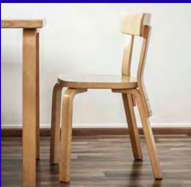
Artek Chair 69 1935