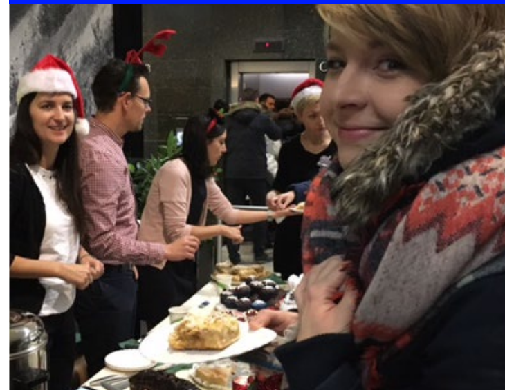
Xmas Coffee Service