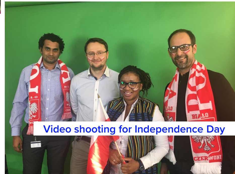
Video shooting for Independence Day