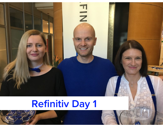
Refinitiv Day 1