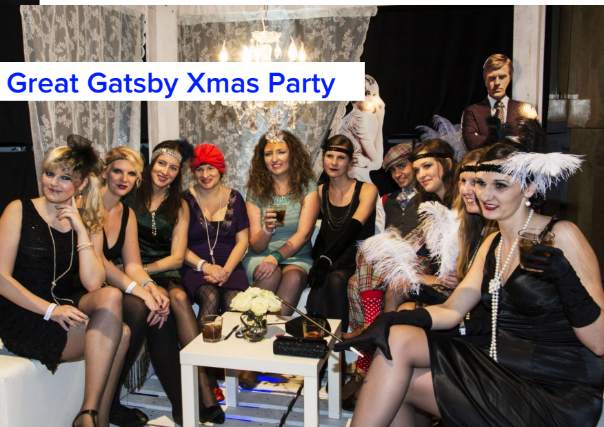
Great Gatsby Xmas Party